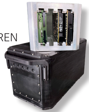
REN VPX 4-Slot

Ground vehicle applications benefit from advanced vetronics systems capable of real-time data collection and analysis. The REN Series supports these needs by providing a scalable, high-computing power framework. Engineers can prototype AI-assisted threat detection, navigation systems and electronic warfare tools, transitioning these prototypes into field-ready deployments with minimal redesigns.