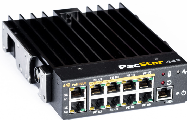
PacStar 442 with PoE

* Reduced operational temp limit when providing maximum PoE power