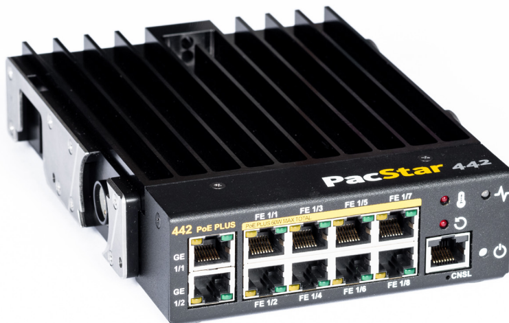
PacStar 442 with PoE+

The module integrates seamlessly with other PacStar 400-Series standard small form factor modules, providing the best in small size, flexible power, and environmental ruggedness. PacStar also offers a wide array of system packaging options for PacStar 400-Series, including briefcase, transit case, rack mount, vehicle mount, and backpack transport options.