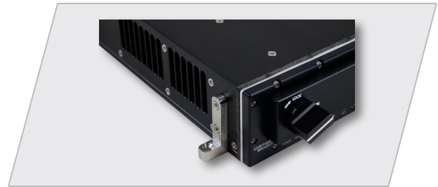
Figure 3: DTS1 with L-bracket mounting

The DTS1 provides two mounting options that make it easy to integrate into your platform: DZUS panel or L-brackets. The DZUS flange allows the unit to be mounted in a standard panel mount. Alternatively, the DTS1 comes with four L-brackets attached to threaded holes on the sides. With the L-brackets, the DTS1 can be bottom-mounted, top-mounted, or side mounted. This flexible option allows the use of a conduction-cooled plate for severe environments.