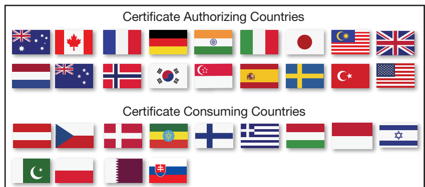
Figure 1: Common Criteria Recognition Arrangement (CCRA) member countries

The rugged NAS is easily integrated into network-centric systems and houses one Removable Memory Cartridge (RMC) which is considered unclassified when in transport. The RMC can be easily removed from one DTS1 and installed into any other DTS1 providing full, seamless, data transfer between one or more networks in separate locations (e.g. from ground to vehicle to ground), providing quick data offloading.