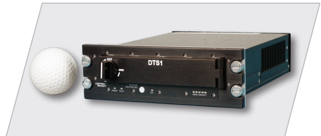
Figure 4: DTS1 with DZUS mounting