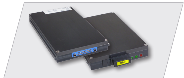
Figure 5: RMC rear and front views

The DTS1 RMC was uniquely designed to avoid obsolescence issues and increase insertion cycles. The RMC is based on industry standard 2.5" SATA SSDs enabling the RMC to take advantage of the broad industrial base and incorporate any of the widely available 2.5" SSDs up to 8TB currently. As a result, the RMC design allows DTS1 to leverage the dynamic and fast paced technical developments of the SSD industry. Read the white paper " Choosing the Best Location for Your Data-At-Rest Encryption Technology ".