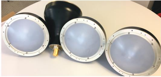
9" Lens Antennas