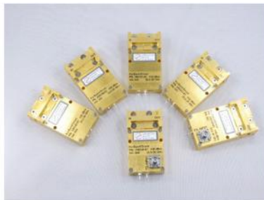
Power Amplifiers Up to 10W