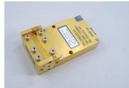
W-Band GaN Amplifier