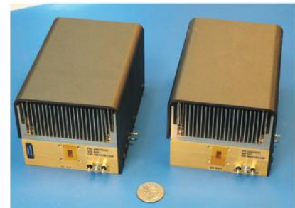
Solid State Power Amplifiers