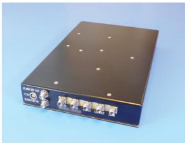
MMW Block Converters